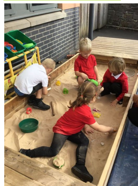
Reception have been settling in brilliantly!