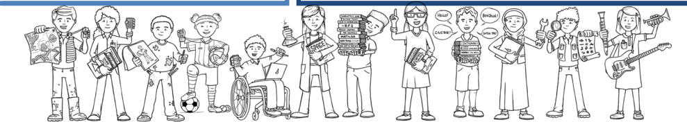
Geographers • Mathematicians • Artists • Athletes • Authors (writer) • Scientists • Authors (Reader) • Philosophers • Linguists • Engineers • Historians • Musicians